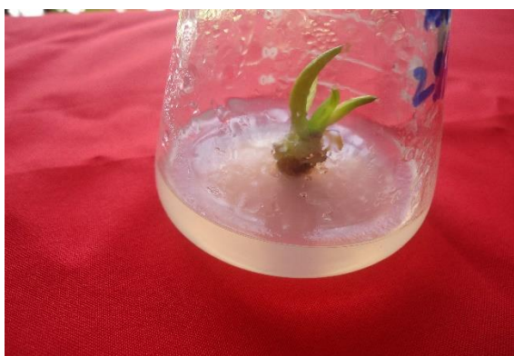
Figure 1 : Shoot Initiation from Shoot tip Explant of Jackfruit

This finding differed with present finding as the highest number of multiple shoots produced in this investigation in the medium supplemented with 4.0 \text{ mg}^{-1} BAP. Actually more success obtain from woody species like jackfruit is difficult due to different contaminations, phenolic compound formation, vitrification etc.