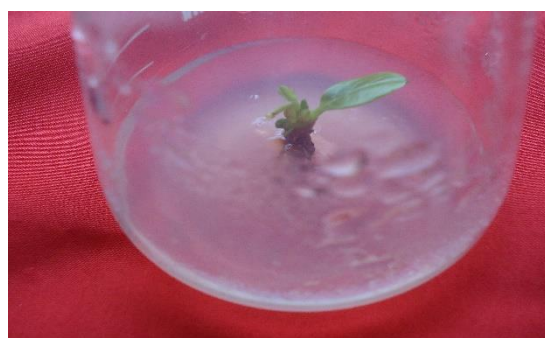
Figure 2: Shoot Production in MS Medium Fortified with 4.00 mg/l BAP and 2.00 mg/l NAA

Means in a column followed by uncommon letter (s) varied significantly at 5% level of significance.