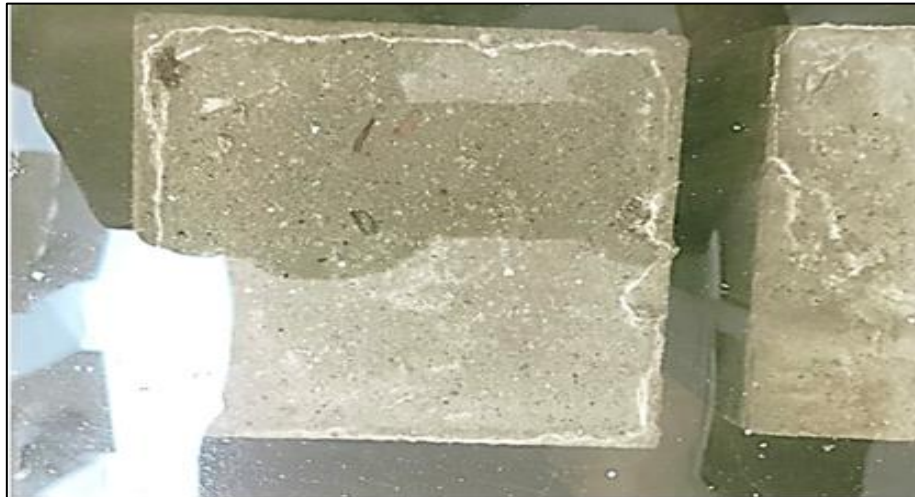
Figure 3: Precipitation of Calcite on the Surface of CC Concrete

After curing for 7, 14, and 28 days, this concrete, when compared to standard cement concrete, assists in achieving compressive strengths of 31.76 percent, 17.52 percent, and 21 percent for 10 percent calcined clay replacement, 27 percent, 25.19 percent, and 24 percent for 15 percent calcined clay replacement, and 20.84 percent, 27.10 percent, and 24 percent for 20 percent calcined clay replacement. Comparing the compressive strengths of OPC, bacterial, and calcined clay concrete is shown in Fig. 4.