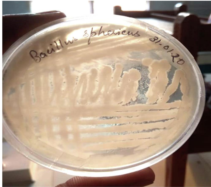
Figure 1: Growth of B. Sphaericus on Agar Plate

ideal density value were used to calculate the number of bacteria per millilitre. The growth of a bacterial culture on an agar plate is shown in Figure 1.