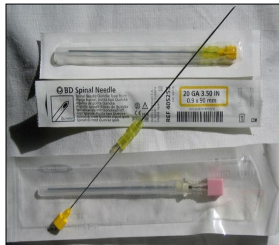
Fig 4: Lumber Puncture Needle