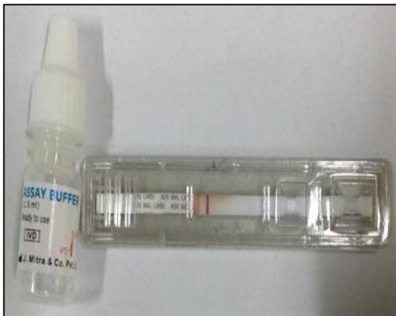
Fig. 3 Malaria Card

When the complex meets the line of the corresponding immobilized antibody, the complex is trapped forming a purplish pink band which confirms a reactive test result. Absence of a coloured band in the test region indicates a negative test result. To serve as a procedural control an additional line of anti-mouse antibody has been immobilized on the strip as control.