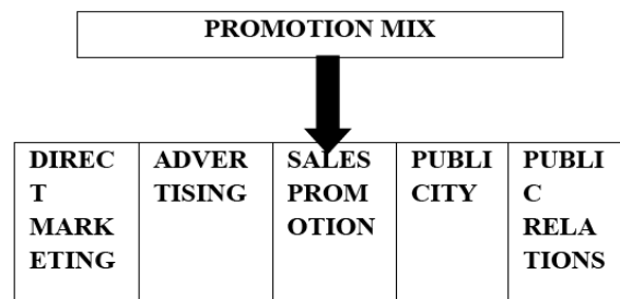
Fig 2: Promotion Mix Tools

Sales promotion also helps in understanding the buying behavior of consumers since it helps in identifying which customers prefer shopping during the offer session and which customers prefer on time delivery and other services while buying a product online. Thus, it helps in customizing the offers and services offered to different customers based on their buying patterns.