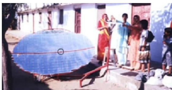
Manual changing of length of the reflector's rear support for seasonal adjustment

The power output varies with the season (Fig: 2). The Sun which shines more from the front into the reflector sees a larger reflector (large aperture), and thus more power is collected. In the same way, a sun shining more from behind sees a smaller reflector and less power is collected. A 2.7 m 2 reflector can typically bring 1.2 lts of water to boiling point within 10 minutes. The circle (see figure 5) at the center highlights the position of the lever for the seasonal shape change.